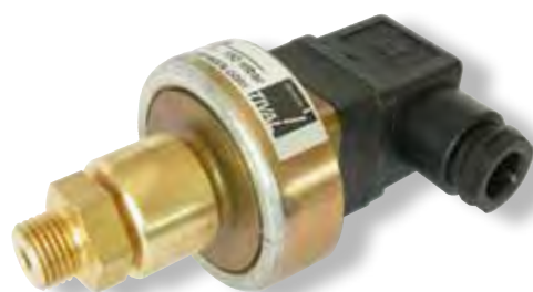
FF 702 (upon request)